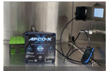
APCO-X™ in test chamber